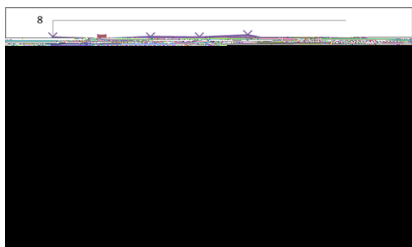
Figure 1: Results of pH Measurement Graph