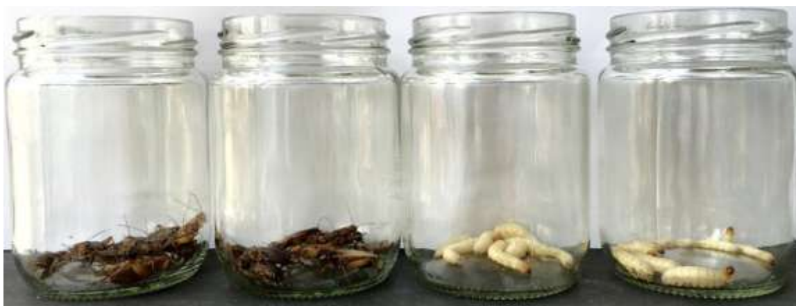
FIGURE 1. Gryllus bimaculatus and Galleria mellonella Before Treatment