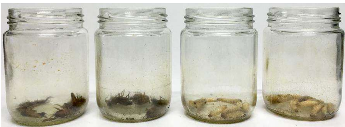
FIGURE 2. Gryllus bimaculatus and Galleria mellonella After Treatment

The average mortality of Gryllus bimaculatus and Galleria mellonella was examined for 24 hours after spraying each extract concentration. As shown graphically in Figure 3a and Figure 3b, the mortality of both insects increased with the increase of extract concentration. The mortality was caused by the poisoning mechanism of tobacco extract through respiratory system, skin contact and digestive tract [27]. Based on the result, higher mortality of Galleria mellonella larvae was obtained at faster rate compared to Gryllus bimaculatus . Such phenomenon might indicate that Galleria mellonella larvae had weaker resistivity towards the toxicity of the extract, so it only required low concentration to cause high mortality. Moreover, the entry of the extract was observed to be more intense because the larvae could not mobilize as fast as Gryllus bimaculatus , so they were unable to escape well. This caused them to consume more of the extract residues within the container. Due to its soft and thin cuticle, the extract became more readily absorbed into their body.