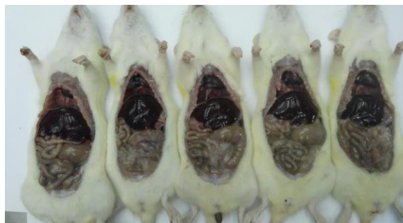
Figure 1. Macroscopic Observation of Visceral Organs of Wistar Rats

normal range. During 24 hours of observation, no straub tail elevation, piloerection, ptosis, lacrimation, catalepsy, salivation, tremor, seizures and writhing were detected. Moreover, all Wistar rats showed normal response on the pineal reflex, corneal reflex, and breathing. Other parameters such as reflex, hanging, retablism, flexion, hafner, defecation and urination did not show any change after administration of the test sample. Grooming activity slightly decreased after administration of the test preparation, but still considered normal. The following figure revealed the macroscopic observation of organs on the 14th day of testing. Based on the observation, it was concluded that no organ abnormalities were found in all of the Wistar rats.