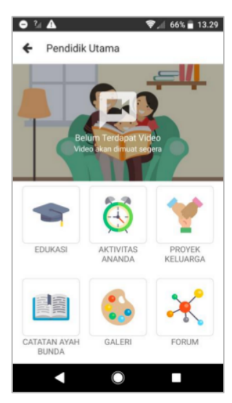
Figure 2. Parents UP modules

The five domains were deployed in Parents UP application modules represented by six main features including education (EDUKASI), student activity (AKTIVITAS ANANDA), family project (PROYEK KELUARGA), parents' note (CATATAN AYAH BUNDA), gallery (GALERI), and forum (FORUM) as shown in Figure 2. The design of such features were particularly to address the challenges encountered by parenting programmes in Indonesia as reported in Tomlinson and Andina (2015).