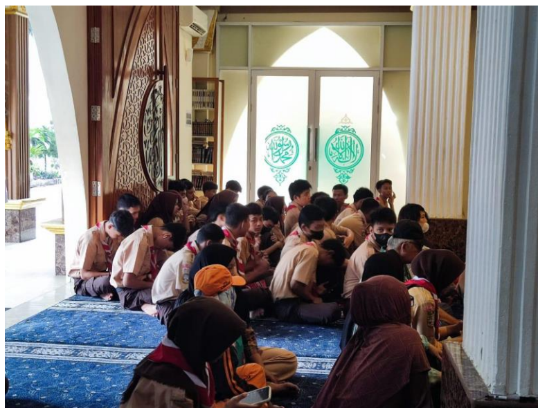
Figure 2. Interaction among the students during the workshop

On the third visit, the team facilitated simulations, games, focus group discussions, and role-playing activities. Participants thoroughly enjoyed these engaging exercises, effectively conveying the importance of parenting education in safeguarding adolescent mental health.