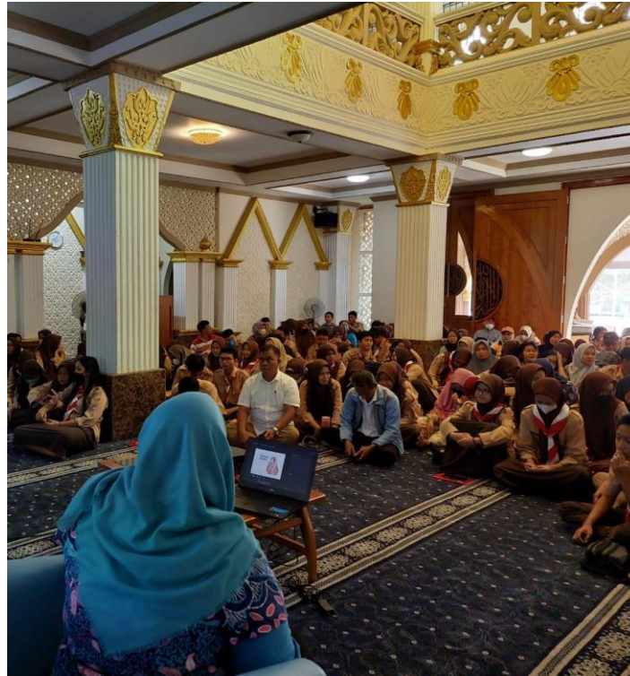
Figure 1. Workshop day 1

By learning effective parenting strategies, mothers can play a vital role in supporting their teenagers and guiding them towards healthy choices.