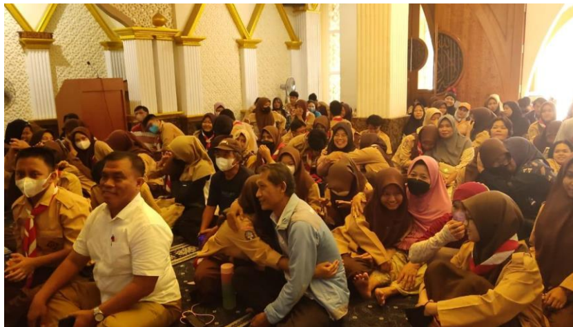
Figure 3. Parent and Student reaction

Parenting programs can be a valuable tool for mothers to learn and develop skills to effectively raise their adolescent. These programs aim to align the approaches used at home with those used in playgroups or day-care settings, fostering consistency in a child's development. Ultimately, effective parenting programs can contribute to children growing into well-rounded individuals with positive personalities. Heng et.al. (2020) reminded the crucial role of parenting pattern toward the attitude of adolescent in big cities.