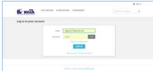
Figure 2. Front End Login Interface

Spare parts data categorized into 3 major groups as Fast Moving, Slow Moving and Consignment for the ease of use. After registered into the system thru login page (Figure.2), user may choose in which group is the spare part they would like to search. Registered user may login with their email and password, others must create new account registration and waiting for approval before starting to use this application.