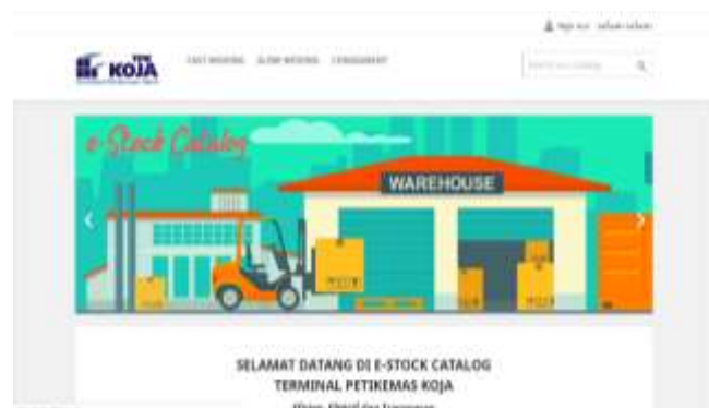
Figure 1. Front End Interface

The front or frontend display of the Koja e-Catalog TPK website can be seen in the Figure.1.