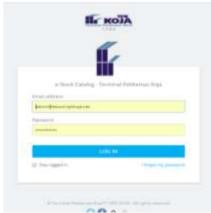
Figure 4. Back End Login Interface

Unlike the user login, no registration menu available here because the backend user must be registered directly by the super admin.