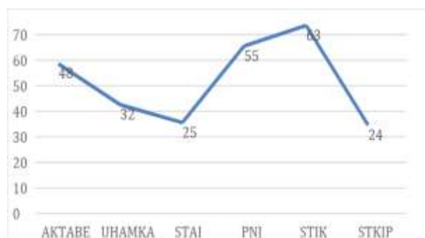
Fig. 1. Sample distribution based on Institution

The participants of this study comprise 252 students enrolled in English language programs across six higher education institutions in Indonesia, namely; Politeknik Negeri Jakarta (PNJ), STAI Maarif Magetan, STIK Siti Khadijah Palembang (STIK), Universitas Muhammadiyah Prof. DR. HAMKA (UHAMKA), STKIP PGRI Jombang (STKIP), and Akademi Kebidanan Tahirah Al Baeti Bulukumba (AKTABE). Sample selection employed random sampling methodology, facilitated through the distribution of online questionnaires using Google Forms. Detailed demographic information pertaining to the participating students is elucidated in Figures 1 - 3.