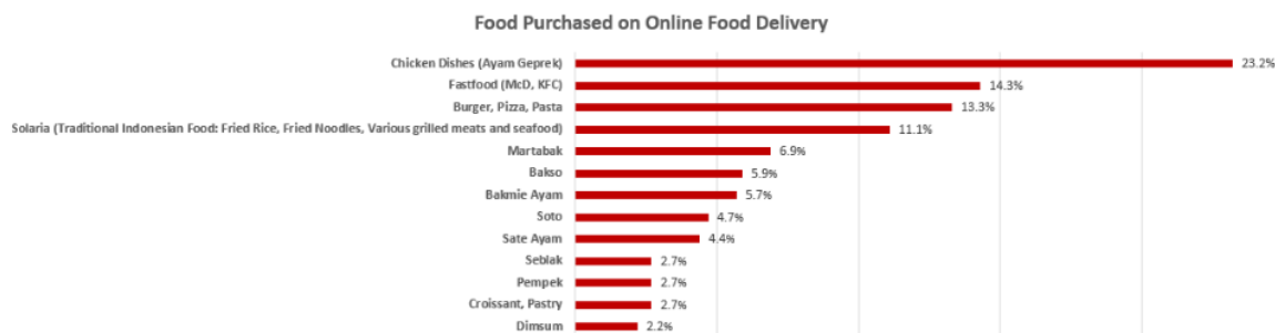
Figure 1. Food purchased in the last 7 days