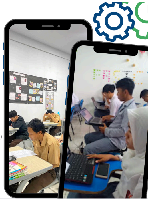
Picture 2: SEO, Content Marketing, Social Media Marketing, and Analytics

Additionally, forming a student entrepreneurial community fosters a collaborative environment conducive to knowledge sharing and collaboration. This community serves as a platform for students to engage in meaningful discussions, share experiences, and collaborate on entrepreneurial endeavors, enriching their learning journey. By implementing these solutions, the initiative aims to equip young entrepreneurs with the requisite skills and knowledge to leverage digital marketing strategies effectively. The ultimate goal is to empower students at SMA Perjuangan Terpadu to succeed in their entrepreneurial ventures by harnessing the power of digital marketing. Through these concerted efforts, it is anticipated that students will emerge as adept digital marketers poised to make meaningful contributions to the entrepreneurial landscape.