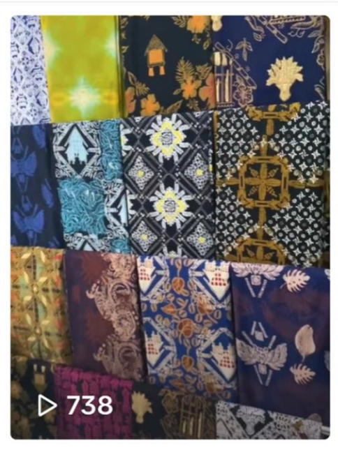
Kenalan sama Chanting ...