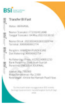
Bukti Transfer.jpeg 119K

Englisia Journal <englisia.journal@ar-raniry.ac.id> To: Hamzah Puadi Ilyas <hamzahpuadi@uhamka.ac.id>