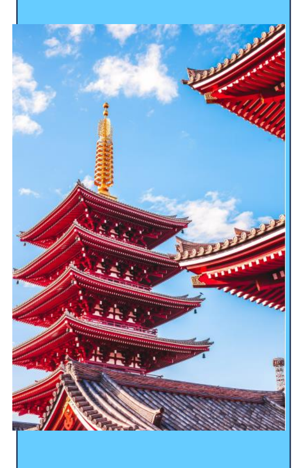
Table of Contains: