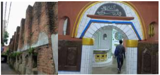
Figure 2. Side view and inside of the Pintu SeribuMosque

This research activity was started by conducting interviews with mosque caretakers to dig up information about the history of the thousand door mosque. Next, a thermometer was installed in each room and the light intensity was measured in several rooms. The data that has been collected is then analyzed quantitatively using descriptive statistical analysis.