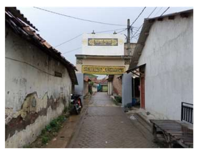
Figure 3. The Pintu Seribu Mosque Gate.

The mosque as the central place of society was formed since the migration of the Prophet Muhammad SAW from Mecca to Medina. In Islamic history, the first mosque built by the Prophet Muhammad was the Quba Mosque, followed by the construction of the Nabawi Mosque which is frequently visited by Muslims from all over the world during the Hajj and Umrah seasons. The condition of the mosque then and now has undergone significant changes. Mosques built in the past, such as the Quba Mosque and the Nabawi Mosque, were very simple with earthen floors, walls and roofs with date palm fronds. Mosques have played a strategic role since the time of the Prophet Muhammad. As well as being a place of worship, the mosque was used during the time of the Prophet Muhammad to settle disputes, making it a place for settling social problems. Since the beginning.