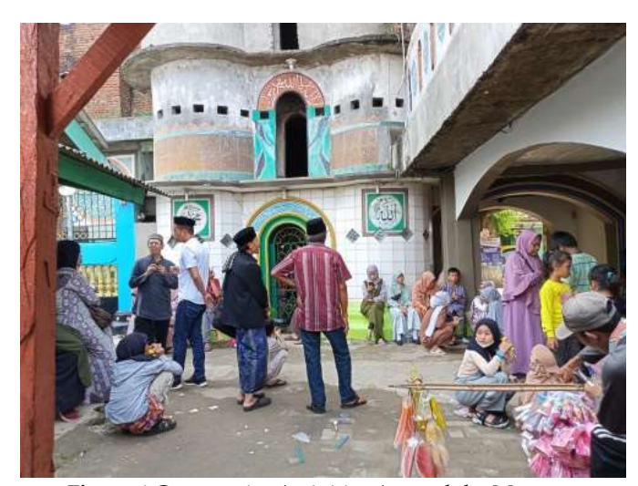
Figure 4. Community Activities Around the Mosque.

Even though it was built in 1978, tourists are very enthusiastic about visiting the Pintu Seribu mosque. According to Ashadi, a historical building can make the surrounding environment develop. This is what makes the Pintu SeribuMosque frequented every day, and