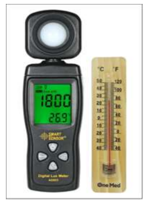
Figure 1. Lux meter and room thermometer

analyze the historical significance of the mosque and to measure lighting and room temperatures across various sections. The main objectives are to conserve the mosque's historical and cultural significance, promote it as an educational tourist destination, and safeguard its historical legacy(Sukmawati, 2017; Sukmawati et al., 2021; Sukmawati & Wahjusaputri, 2018). Data collection occurs during both morning and afternoon sessions, utilizing tools such as observation forms, interview surveys, Lux Meters, Room Thermometers, and stationary materials(Nurliana & Sukmawati, 2023). This comprehensive examination is pivotal for an enhanced comprehension of the Thousand Gate Mosque and for optimizing its role within both religious and cultural contexts(Aisyah et al., 2023; Fauziah & Sukmawati, 2023; Novianti et al., 2023; Sukmawati, 2023). The instruments used in this study include observation forms, interview surveys for mosque administrators, and tools for measuring room lighting and temperature, such as Lux Meters and Room Thermometers, as illustrated in Figure