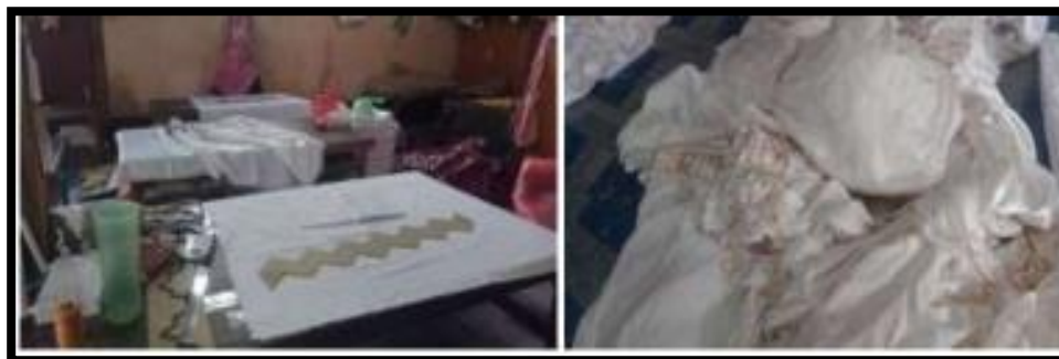
FIGURE 1. (a) Fabrics being patterned and (b) finished combing

Sasirangan cloth is identical to the colour and motif that looks uniform. Before entering the colouring process, white fabrics (types of cotton, Bisag, Balacu, Kaci, King, Primisima, Satin, silk, white Mori and as desired) are drawn with distinctive motifs using pencils directly or using patterns or patterns from cardboard. , then sewn (straightening) following the lines of the painting and pulling it firmly (shrink) until the fabric looks wrinkled. These cloth motifs describe the shape of plant and animal parts, types of food, spices, natural phenomena and characters in the stories of the Banjar people. The following is Figure 1 of the fabric being patterned and finished combing.