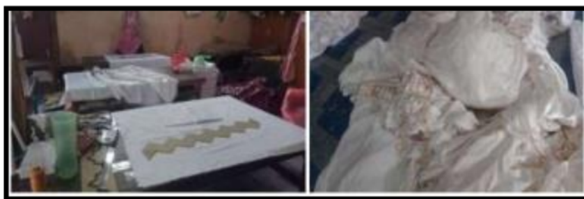
FIGURE 1. (a) Fabrics being patterned and (b) finished combing

Sasirangan cloth is identical to the colour and motif that looks uniform. Before entering the colouring process, white fabrics (types of cotton, Bisag, Balacu, Kaci, King, Primisima, Satin, silk, white Mori and as desired) are drawn with distinctive motifs using pencils directly or using patterns or patterns from cardboard. , then sewn (straightening) following the lines of the painting and pulling it firmly (shrink) until the fabric looks wrinkled. These cloth motifs describe the shape of plant and animal parts, types of food, spices, natural phenomena and characters in the stories of the Banjar people. The following is Figure 1 of the fabric being patterned and finished combing.