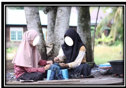
FIGURE 3. The Tread Release Process

The following is Figure 3 about the tread release process.