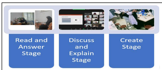
Figure 2. Stages of the RADEC Learning Model

In this study, the use of the RADEC model in an effort to improve students' scientific literacy abilities was used as a treatment that researchers carried out to achieve this goal. The learning process that students follow is in accordance with the RADEC stages, namely Read, Answer, Discuss, Explain, and Create.