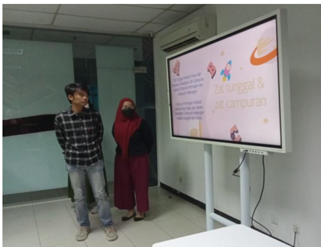
Figure 4. Discuss and Explain Stage

Each student has the provisions to study in class and is ready for the next stage, namely the discuss and explain stages. At the discuss stage, students actively discuss in small groups. This activity makes students exchange ideas and express opinions so that they get the best answer that will be presented. In addition to practicing communication, during the discuss stage students train critical-analytical skills during discussion activities (Sopandi & Handayani, 2019). After participating in the discussion stage in small groups, students follow the explain stage which trains students in developing their higher-order thinking skills and scientific literacy skills in responding to the results of other group discussions.