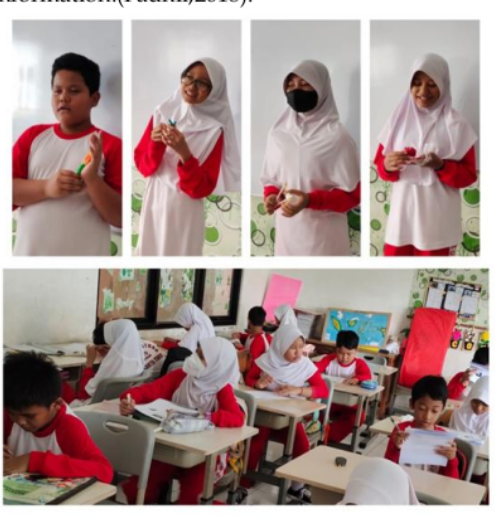
Figure 2: Activities at the stage of discussing and explaining

determine on their own which sections of the lesson plan are simple or complex in this way. Additionally, students may identify if they are slack or attentive readers, whether written instructional materials are simple to comprehend or complex, whether they enjoy reading textbooks or not, and more. Aside from that, the instructor may learn about the progress of every student by looking at their work and asking a few simple questions. It's probable that the instructor will be aware of the various demands of each pupil. The teacher may provide each pupil the right help based on this information.(Fadhil, 2018).