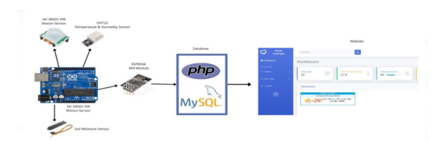
Figure 2. Project Based Learning Berbasis Internet of Things Model