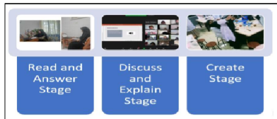
Figure 2. Stages of the RADEC Learning Model

In this study, the use of the RADEC model in an effort to improve students' scientific literacy abilities was used as a treatment that researchers carried out to achieve this goal. The learning process that students follow is in accordance with the RADEC stages, namely Read, Answer, Discuss, Explain, and Create.