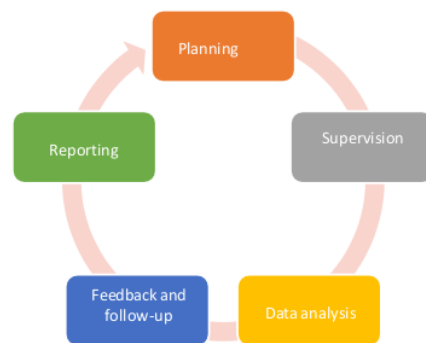
Figure 2. Cycle of Digital-Based Supervision

The implementation of academic supervision is best represented as a cyclical framework that can be effectively executed in a digital format. This cycle can be illustrated as follows: