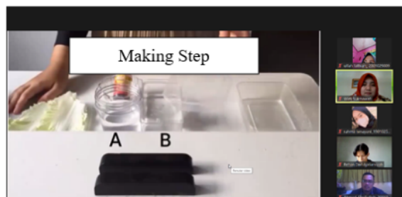
Figure 3. Discussion and Elaboration Stages in Practicum Activities

The items used for the student scientific literacy test meet the RASCH category and all items fit. Changes in the logit value of the pretest and posttest results produced by students varied greatly, besides that the development of students' understanding of scientific literacy also varied. Based on the results of analysis of the average logit value shown in Table 5, the average logit value of the pretest and posttest is different and has increased from 1.2 to 3.2 and the understanding of scientific literacy has also increased.