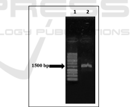
Figure 3: Result of Amplicon Electrophoresis DNA Isolate Bacteria Endophytes BW-1LM from Soursop Leaf. Lane 1: Ladder DNA 1kb Lane 2: product PCR.

process to know the order of nucleotide base. Sequencing is a technique used to sequence nucleotide bases in DNA fragments (Brown, 1995; Sambrook et al., 1989). The results of sequence data processing were analyzed using the nBLAST program online on the NCBI website (http://blast.ncbi.nlm.nih.gov/). The analysis was conducted with the aim of comparing sequenced data (query) from the results of research with DNA sequences from various corners of the world that were deposited and published on DNA banks or Gene Bank.