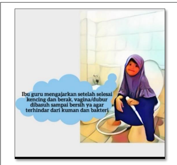
Figure 3 | Training on Cleaning Tools about Genitals/Toilets