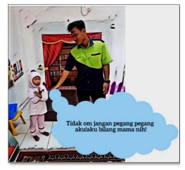
Figure 4 | Knowledge of Abstaining from Sexual Crimes