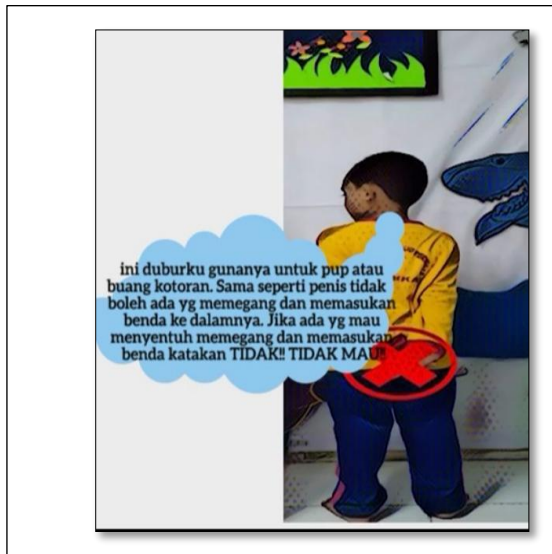
Figure 2 | Knowledge of the Organs of Sexuality