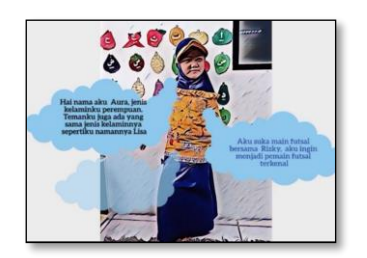
Figure 1 | Knowledge of Gender Identity and Roles

The research data obtained by the perception of 18 families who access the use of digital media for sex education in early childhood 3-6 years shows that digital media technology provides significant benefits for sex education in children. Children show interest and interest when parents allow them to access a parent's smartphone for sex education at home. The use of digital media technology makes it easy for sex education to be understood by children in every dimension namely; 1) Knowledge of recognizing gender identity and roles, 2) Knowledge of sexuality organs, 3) Knowledge of maintaining genital/toilet training, 4) Knowledge of abstaining from sexual crimes and 5) Knowledge of reproduction. Soderman et al. (1982) In a study conducted by the researchers, the five dimensions of sex education in children were in the form of animated videos that were input into each parent's smartphone, so that parents could easily play with their children. An example of visualization of the dimensions of a sex education video prepared, with sound/dubbing accompanied by text, then installed into digital smartphone media technology, as shown in figures 1 to 7.