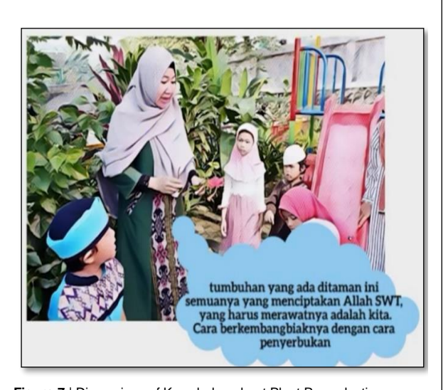
Figure 7 | Dimensions of Knowledge about Plant Reproduction