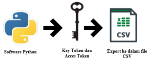
Figure 2. Data Crawling Stage

The crawling data comes from Twitter social media tweets regarding "scarcity of cooking oil". Figure 2 is the stage of data crawling.