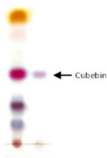
Figure 1. TLC analysis result of LF showed the presence of cubebin and other lignans.

Figure 3 showed that LF inhibits lipid peroxidation, shown by lower MDA levels comparable to Vit-C, and