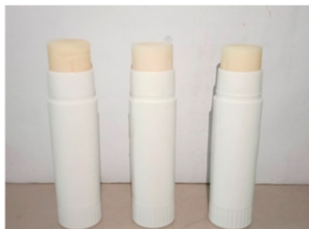
Figure 1. Nigella sativa Balm Stick.