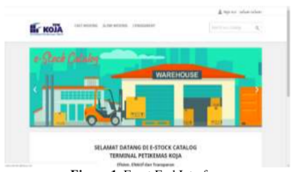
Figure 1. Front End Interface

The front or frontend display of the Koja e-Catalog TPK website can be seen in the Figure.1.