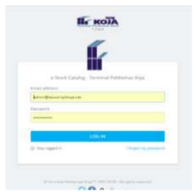
Figure 4. Back End Login Interface

Unlike the user login, no registration menu available here because the backend user must be registered directly by the super admin.