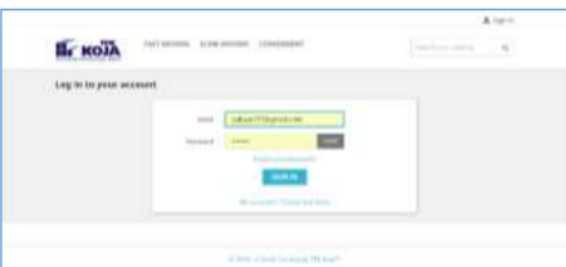
Figure 2. Front End Login Interface

Spare parts data categorized into 3 major groups as Fast Moving, Slow Moving and Consignment for the ease of use. After registered into the system thru login page (Figure.2), user may choose in which group is the spare part they would like to search. Registered user may login with their email and password, others must create new account registration and waiting for approval before starting to use this application.