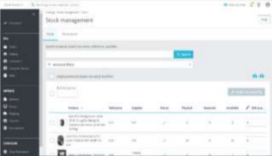
Figure 6. Stock Management Interface (Stock Tab)

The appointed operators or users to operate this e-Catalog are able to input the detail spare part specification from the menu in the backend interface (Figure.5) and also be able to monitor the movements of existing spare parts. The most interesting features is the Stock management features that could be used to manage spare part information in detail such as product brand and supplier (Figure.6).