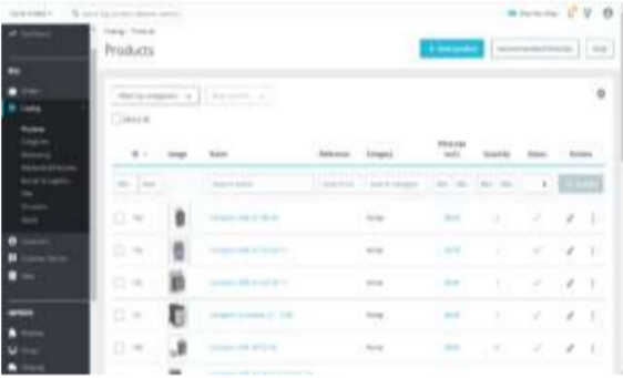
Figure 5. Back End Interface

Unlike the user login, no registration menu available here because the backend user must be registered directly by the super admin.