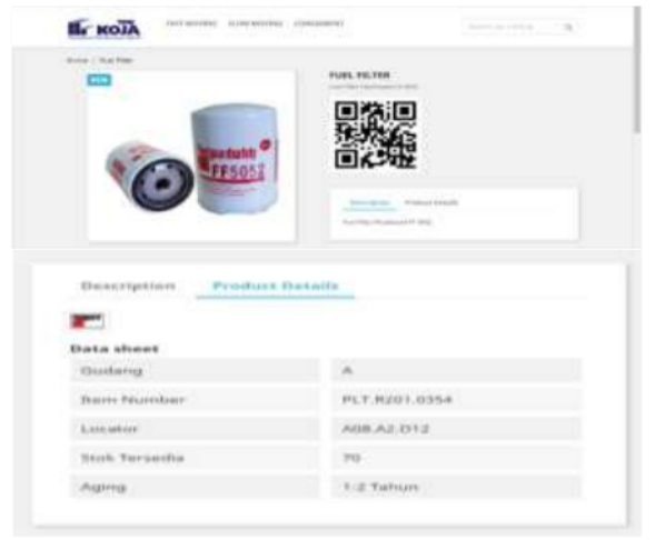
Figure 3. Product View

After the user has successfully logged in, the user can now browse for the desired product as seen on Figure.3 below.