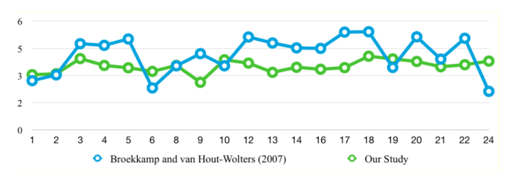
Figure 1: Average scores between Broekkamp and van Hout-Wolters (2007) and Our Study

We also compared each item's means against the Broekkamp and van Hout-Wolters study (see Figure 1). Although this study used a 1 point scale less than Broekkamp and van Hout-Wolters study, we found that our sample teachers also tended to have negative beliefs about educational research. This trend can be seen from the mean of each item which is higher than 3 (see also Table 2 for comparison).