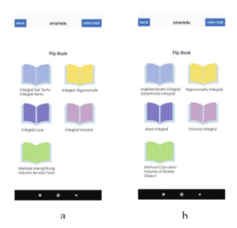
Fig. 3. (a) Flip book menu Indonesia version; (b) Flip book menu English version

On the main menu Indonesia there are Flip book (module learning use Indonesia Language), Tutorial video link on Youtube use Indonesia Language), and Student center (platform e-learning only UHAMKA students) inside there assignent, resources, and forum to learning and similar to the main menu English version there are Flipbook and Tutorial Video use English Language and the difference is there is an evaluatioan with a multiple choice quis (for public)