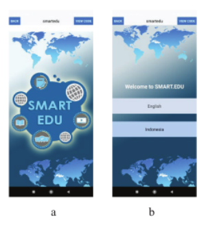
Fig. 1. (a) Loading Screen; (b) Option menu screen

The following are some screen design application screenshots.