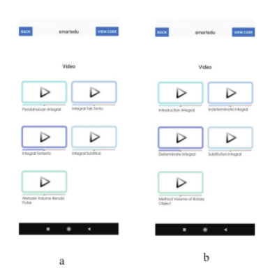
Fig. 4. (a) Video menu Indonesia version; (b) Video menu English version

The application is given a user interface rating. Based on the findings from the Fig. 2, Fig. 3, and Fig. 4, it can be concluded that respondents have a high level of agreement on the mobile application development user interface. This is indicated by the overall mean scores for 5 user interface principles at a high level (mean Content = 3.59; mean Natural Use = 3.63; mean Navigation = 3.53; mean Consistency = 3.51; and mean Flexibility = 3.58).