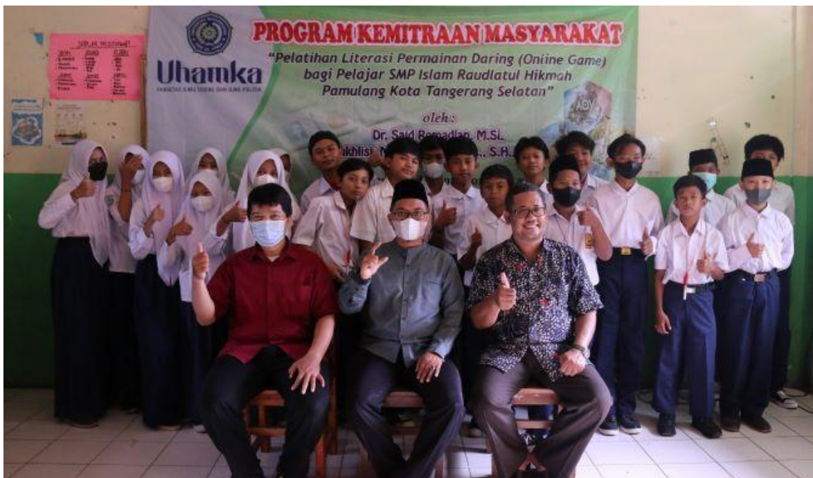
Figure 4. Community Service Implementation Team, Raudlatul Hikmah Islamic Junior High School Principal, and Students Participating in Online Game Literacy Training.