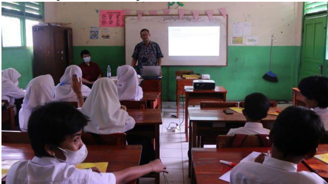
Figure 2. Implementation of Online Game Literacy Training by Community Service Implementation Team.