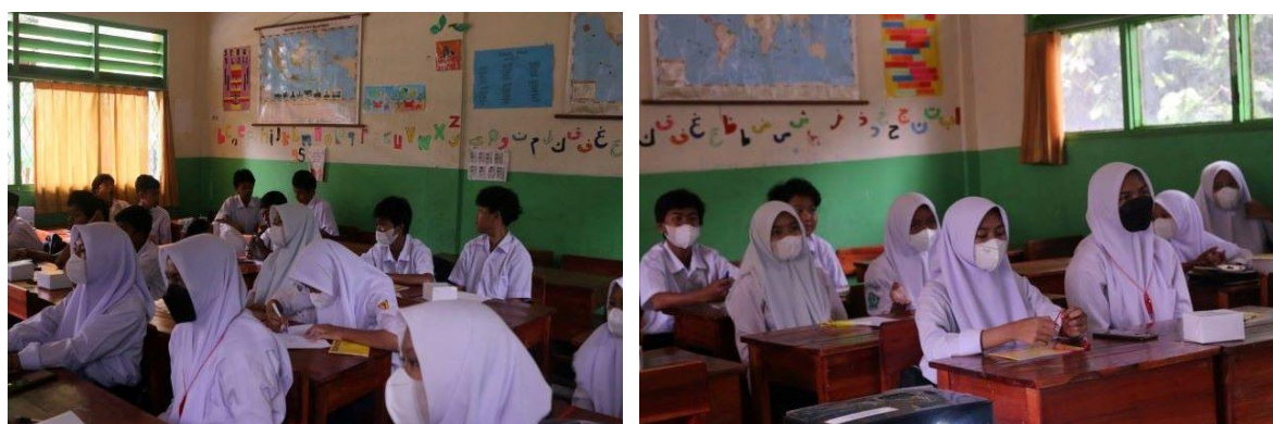
Figure 3. Raudlatul Hikmah Islamic Junior High School Students take the Online Game Literacy Training

Previous studies reported that online games have the following impacts. First, its addiction in adolescents affects their health, psychological, academic, social, and financial aspects [14]. Second, online games can cause a lack of focus on learning activities and spending money in internet cafes [13]. Third, it triggers verbal abuse, such as accusing, blaming, undermining, discounting, and name-calling [17].