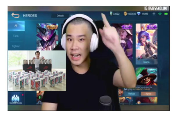
Figure 2. Jess No Limit Video Streaming

participation in national and international competitions via online games. The Youtuber conveys several declarative statements that serve to inform others, so that the expected response is the audience's attention (Elmita, et al, 2013: 140; Ramlan, 2001: 27).