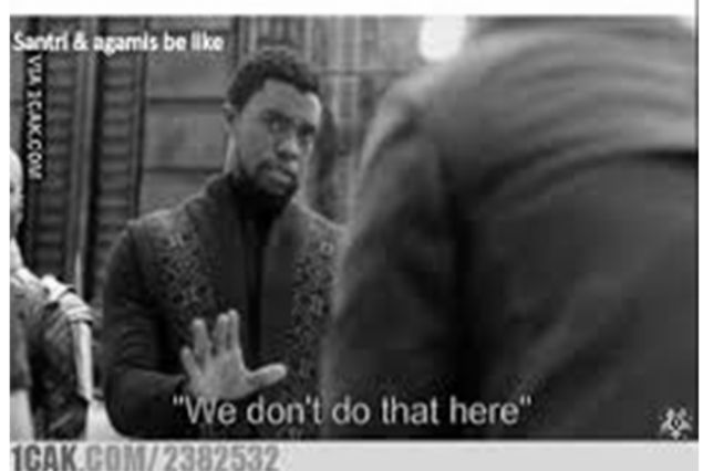
Figure 5. Meme of Seikerei.

Ketika Jepang minta pribumi ngelakukan Seikerei (Menghormati matahari dengan cara membungkukkan badan)