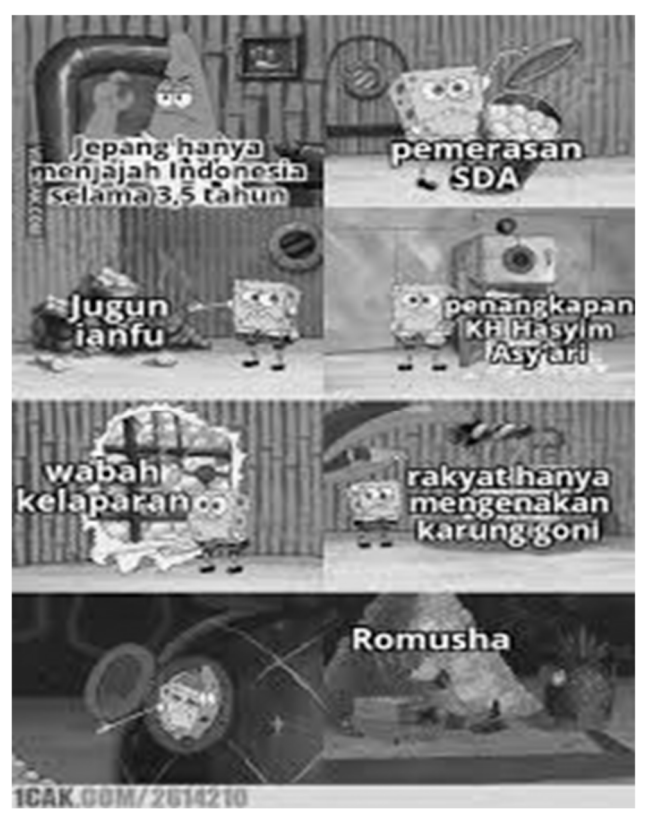
Figure 6. Picture 6. Meme of the Japanese Occupation.

This meme is taken from one of the scenes in the Black Panther film 'Avengers: Infinity War' saying,' We don't do that here' (Matt, 2018b). The meme represented an event when the Japanese wanted the Indonesian people to perform Seikerei by bowing their bodies and respecting the sun. Santri (Islamic school students) and religious groups who felt who Seikerei was not in line with their faith's guidance opposed this gesture. The teacher should also clarify