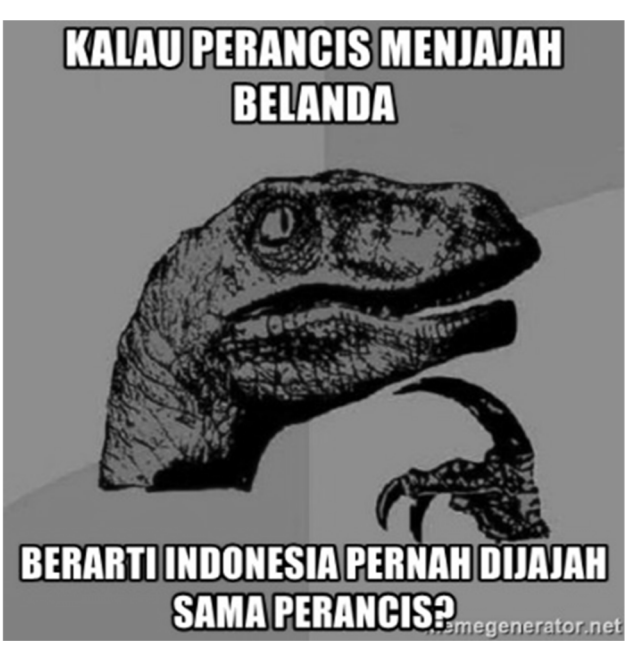
Figure 3. Meme of the French Colonialism.

All informants argued that the meme in figure 2 is correct, that if Dutch never colonize the Nusantara, Indonesia could never have existed. The meme also makes readers to think. The meme consists of three panels containing conversations be-