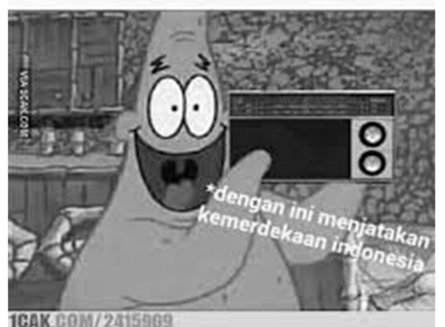
Figure 9. Meme Suka Cita Rakyat Indonesia.

toon 'Bugs Bunny's "No". This meme depicts the Barisan Pelopor troop's who came late in reading the text of the proclamation. They asked Sukarno to read the proclamation once again. Sukarno, in this case portrayed by Bugs Bunny, rejected it, because the proclamation was only read once and refers to forever (Johari, 2020). The teacher can use this meme to describe the event the Barisan Pelopor troops wanted Sukarno to repeat the proclamation.