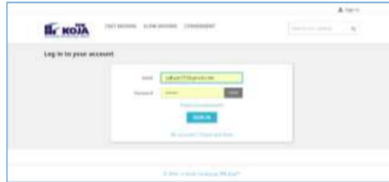
Figure 2. Front End Login Interface

Spare parts data categorized into 3 major groups as Fast Moving, Slow Moving and Consignment for the ease of use. After registered into the system thru login page (Figure.2), user may choose in which group is the spare part they would like to search. Registered user may login with their email and password, others must create new account registration and waiting for approval before starting to use this application.