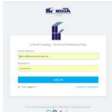
Figure 4. Back End Login Interface

Unlike the user login, no registration menu available here because the backend user must be registered directly by the super admin.