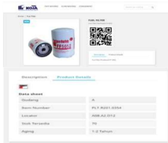
Figure 3. Product View

After the user has successfully logged in, the user can now browse for the desired product as seen on Figure.3 below.