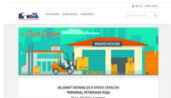
Figure 1. Front End Interface

The front or frontend display of the Koja e-Catalog TPK website can be seen in the Figure.1.