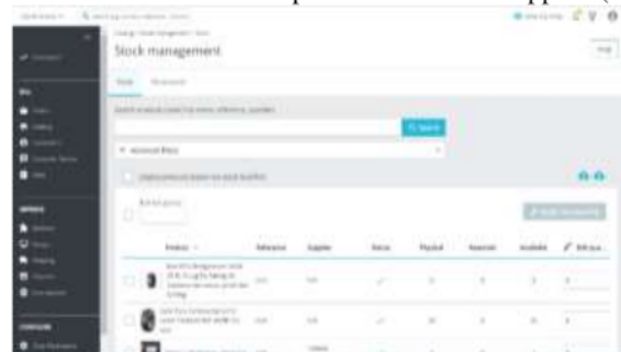
Figure 6. Stock Management Interface (Stock Tab)

The appointed operators or users to operate this e-Catalog are able to input the detail spare part specification from the menu in the backend interface (Figure.5) and also be able to monitor the movements of existing spare parts. The most interesting features is the Stock management features that could be used to manage spare part information in detail such as product brand and supplier (Figure.6).