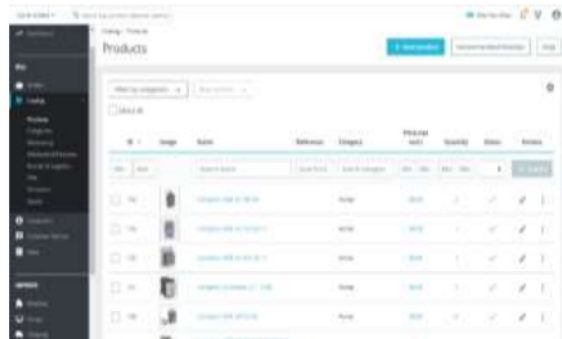
Figure 5. Back End Interface

Unlike the user login, no registration menu available here because the backend user must be registered directly by the super admin.