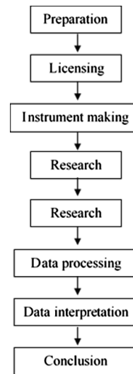
Figure 2. Flowchart Research

This research was conducted at the boarding school Al Hamid East Jakarta with students of science class as respondents as many as 42 people. Here are the stages of the research workflow.