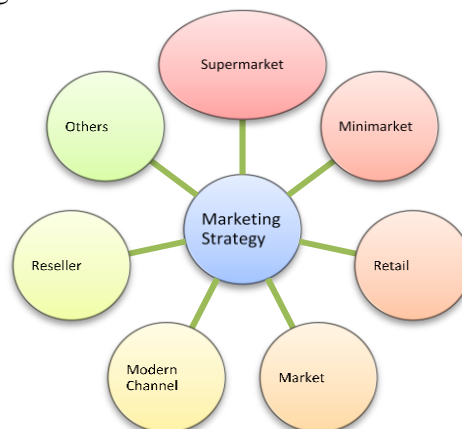
Figure 1. Marketing strategy of South Tangerang city from 2018

The interviews centered on the issues of SMEs including the characteristics of trade shows, the product category, sales turnover, and the contribution of the trade shows and community entrepreneur to the development of SMEs. Since 2018, the Municipality of South Tangerang, particularly the Department of Cooperative, Small, and Medium Enterprises has adopted a lot of strategies to assist SMEs to promote the products. It adopts the marketing strategy developed by Phillip Kotler (Kotler & Keller, 2016) as seen in Figure 1.