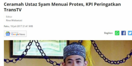
Image 1 News KPI warns Trans TV

Such was the problem faced when one of the hosts uttered an inappropriate sentence on the program.