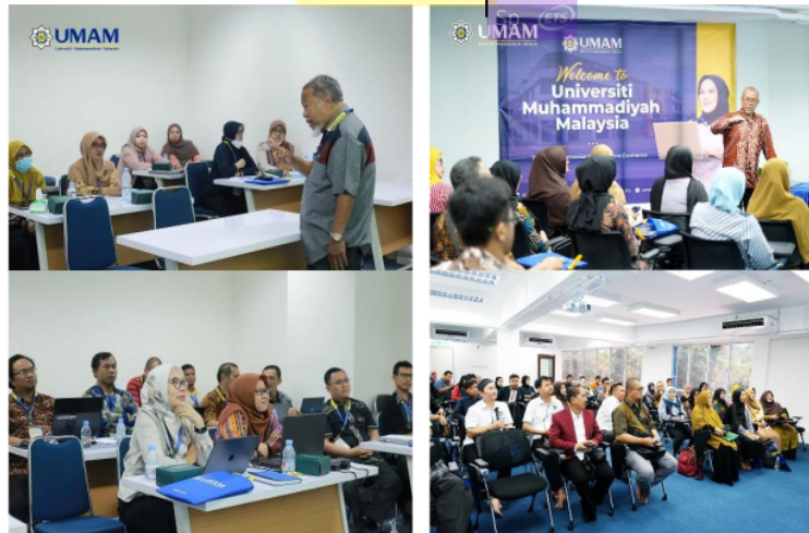
Figure 1: Profile of Universiti Muhammadiyah Malaysia (UMAM)

The realm of education is a symbol of modernization represented by the establishment of the university. According to Moya, the fact that the university is a powerful latent force and can be used in various directions (Moya, 2011). This statement is coherent with one of the pillars of progressive Islam by Muhammadiyah, namely the characteristics of an advanced society characterized by respect for knowledge. Since before independence, it has been suggested at various conferences that Muhammadiyah must have a university.