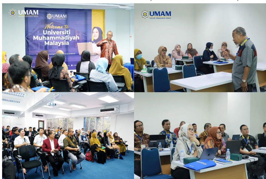
Figure 1: Profile of Universiti Muhammadiyah Malaysia (UMAM)

The realm of education is a symbol of modernization represented by the establishment of the university. According to Moyon, the fact that the university is a powerful latent force and can be used in various directions (Moyon, 2011). This statement is coherent with one of the pillars of progressive Islam by Muhammadiyah, namely the characteristics of an advanced society characterized by respect for knowledge. Since before independence, it has been suggested at various conferences that Muhammadiyah must have a university.