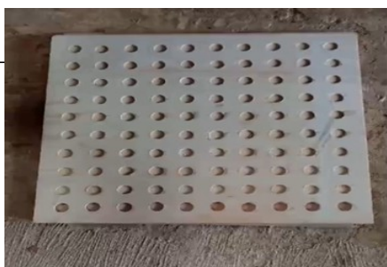
Teaching Aids For The I

The last stage at this stage researchers receive advice and input from media expert validators, material experts, and students. This is done so that the developed product is efficient, effective, and dancing. This stage is carried out throughout development from design to implementation. The following multiplication board media that researchers have developed as follows: