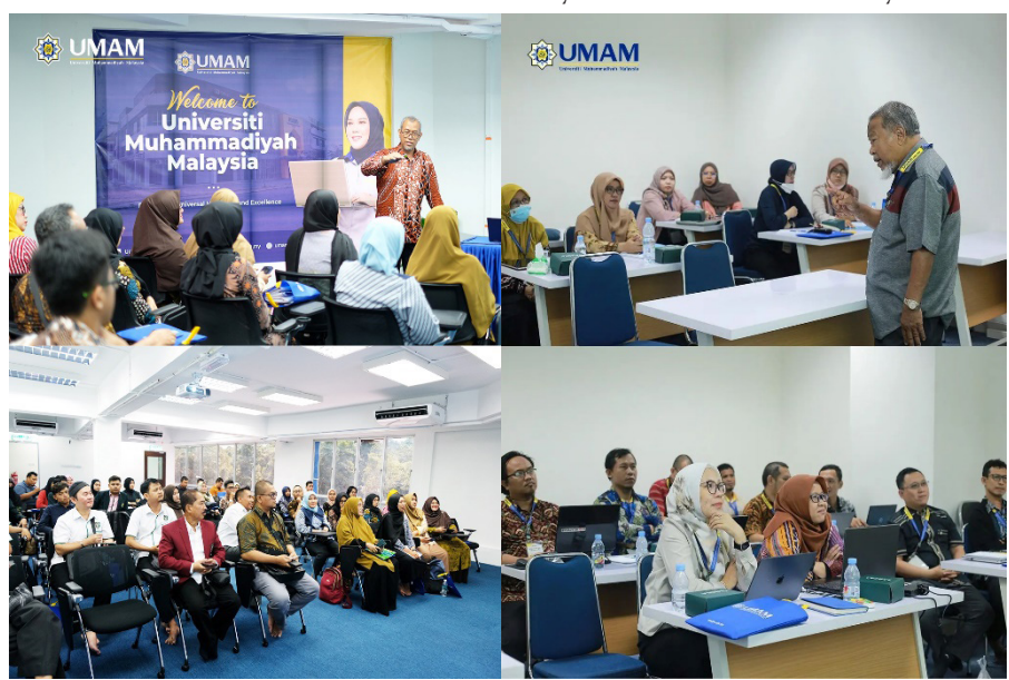
Figure 1: Profile of Universiti Muhammadiyah Malaysia (UMAM)

The realm of education is a symbol of modernization represented by the establishment of the university. According to Moyen, the fact that the university is a powerful latent force and can be used in various directions (Moyen, 2011). This statement is coherent with one of the pillars of progressive Islam by Muhammadiyah, namely the characteristics of an advanced society characterized by respect for knowledge. Since before independence, it has been suggested at various conferences that Muhammadiyah must have a university.