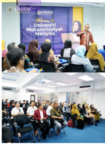
Figure 1: Profile of Universiti Muhammadiyah Malaysia (UMAM)

This condition is in line with one of Muhammadiyah's missions, namely reforming the Islamic education system (Wardiyanto, Hasnidar & Elilhami, 2020). UMAM is located in Perlis because of the existence of the institution as a communication. The essence of communication does not have to be spoken, but there is a physical form in the form of buildings and permits that also belong to communication. Referring to Sui Yan that physical objects that we can see with our own eyes such as buildings are categorized as signs in symbolic communication (Sui Yan, 2017). According to Littlejohn and Foss the basic concepts of semiotics include signs, symbols associated with language, discourse, and non-verbal actions (Littlejohn & Foss, 2007). Furthermore, the people of Malaysia are impressed with Hamka figures such as the former Minister of Education, Maszlee bin Malik. He memorized and deeply studied Hamka's works. This is what lies behind the existence of Muhammadiyah's role in Malaysia and the establishment of UMAM to date (Setiaji, 2023).