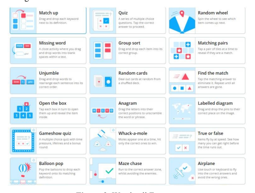
Figure 2. Wordwall Features