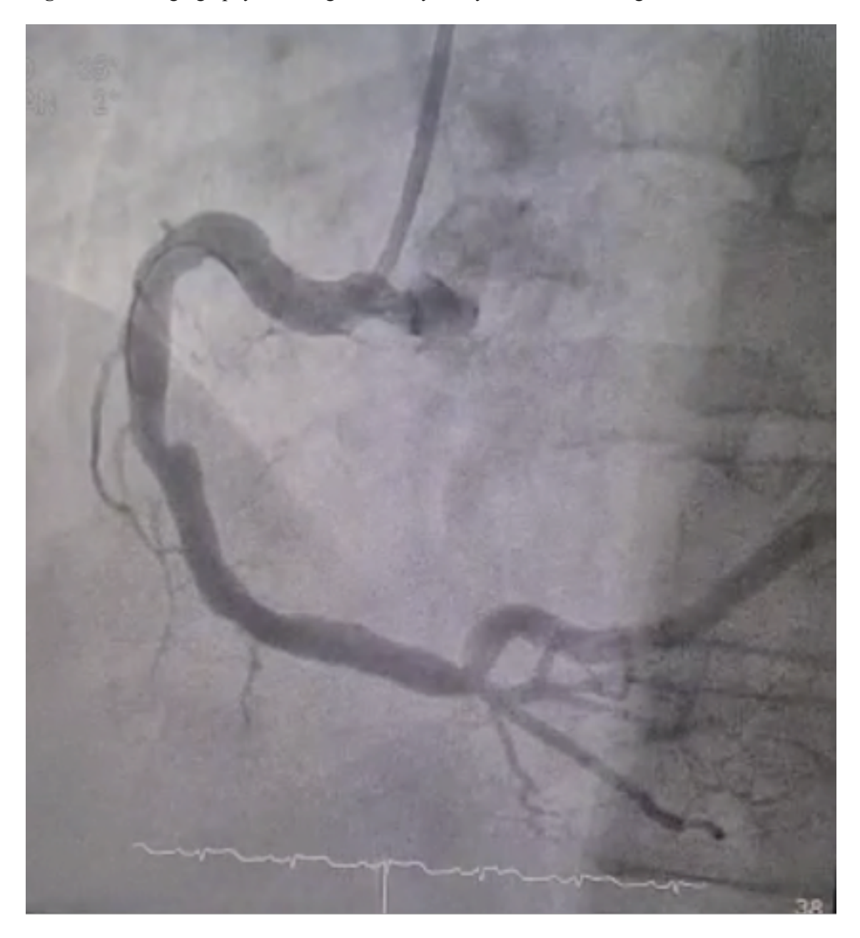
Figure 2. The angiography of the right coronary artery with no remaining air emboli