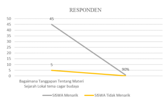
Graph 1. Responses to Cultural Heritage Themes

As many as 90% of respondents stated that local history material based on cultural heritage is very interesting to be presented in the lesson. The study of local history has succeeded in providing additional knowledge about Indonesian history in the past. Students are triggered to look for literature related to the cultural heritage presented, which triggers research on the cultural heritage material presented. Interest in the theme of cultural heritage helps the government a lot in terms of supervision and maintenance of vandalism. (Agnes and Wake: 2011).