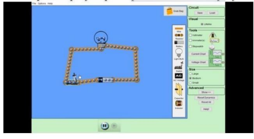
Figure 1 Content in a mobile virtual laboratory Material Expert Validation Results. The results obtained from the first and second stage validation are in table 4.