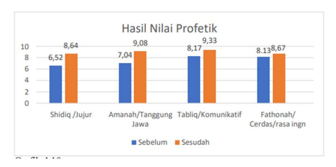
Graphic 3 Prophetic Assessment

Based on table 7 obtained, prophetic from prophetic questionnaires and observations are not much different, it can be concluded that prophetic before using a virtual laboratory application of electric circuits and after using it has a high level of prophetic after using a virtual laboratory application, it can also be presented in graphical 3 form below