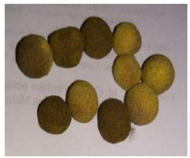
Figure 4. Herbal medicine in pill form

The processing of medicinal plants is carried out by; all the traditional medicinal plants above are boiled until boiling. Boiled water from these medicinal plants can be consumed directly, but there are also those who make the concoction into small pills that can be taken like normal pills. To make a pill, boiled medicinal plants are added with candied sugar and boiled until the water disappears. Then the bran from boiled medicinal plants will be made into small granules. Next, the granules are dried in the sun until dry and ready to be consumed. The following is a form of herbal medicine that has been made into a pill and is ready to be consumed (Haulia et al., 2022).