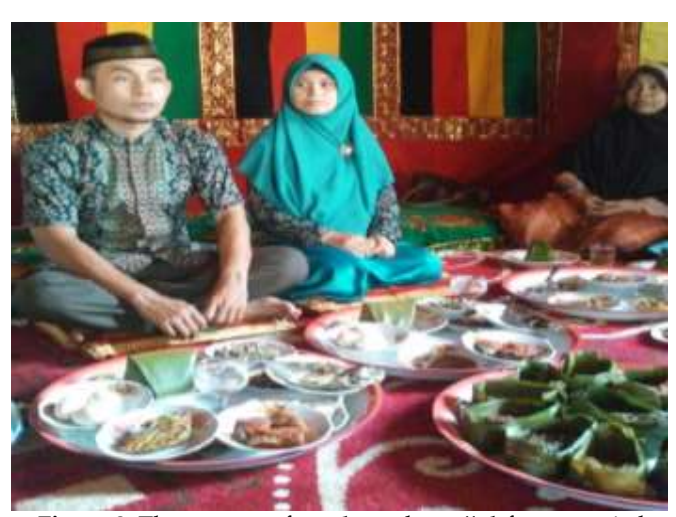
Figure 3. The process of mee bu and peusijuk for a married couple