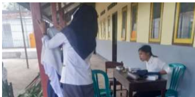
Figure 2. Height, Weight and BMI Measurement Training (SMP IT Hamzanwadi Lunyuk students)

Meanwhile, for Facilities and Infrastructure, each school evaluated has facilities and infrastructure to support the UKS program. Not unlike Sarana, budget allocations to support the UKS program have also been allocated by each school. However, of the 61 schools evaluated, there were still 19 (31.15%) schools whose supporting facilities needed to be repaired and updated because they were no longer functioning well. This is in line with the results of research conducted by Mahfud, (2016) and Janwarin (2021) where a number of facilities and infrastructure supporting the implementation of the UKS program, apart from being limited, also need to be improved. Fariyah (2022), in her research results, concluded that there is a significant relationship between the implementation of the UKS program and budget availability. According to Matin (2016), the success of the implementation of the UKS Program in schools is also determined by the support of facilities and infrastructure.