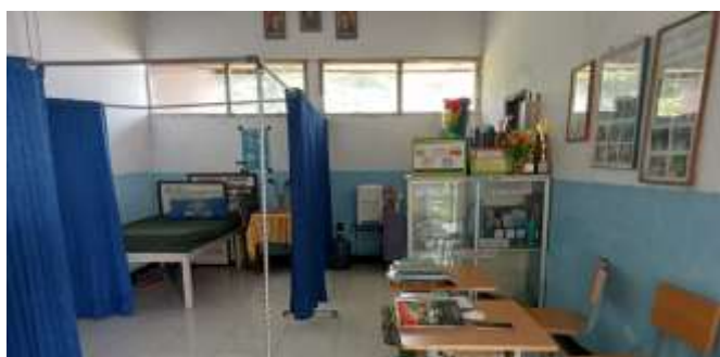
Figure 3. UKS Facilities and Infrastructure (SMP N 1 Lape)

Meanwhile, for Facilities and Infrastructure, each school evaluated has facilities and infrastructure to support the UKS program. Not unlike Sarana, budget allocations to support the UKS program have also been allocated by each school. However, of the 61 schools evaluated, there were still 19 (31.15%) schools whose supporting facilities needed to be repaired and updated because they were no longer functioning well. This is in line with the results of research conducted by Mahfud, (2016) and Janwarin (2021) where a number of facilities and infrastructure supporting the implementation of the UKS program, apart from being limited, also need to be improved. Fariyah (2022), in her research results, concluded that there is a significant relationship between the implementation of the UKS program and budget availability. According to Matin (2016), the success of the implementation of the UKS Program in schools is also determined by the support of facilities and infrastructure.