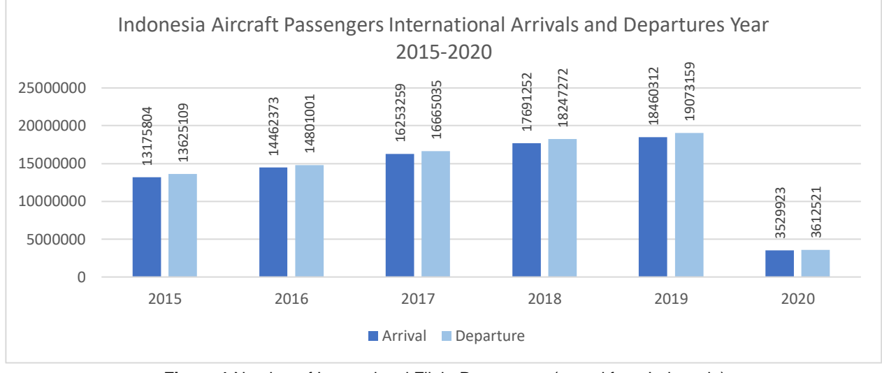
Figure 1 Number of International Flight Passengers (to and from Indonesia)

The potential import of Monkeypox cases in Indonesia is linked to human mobility as a risk factor for disease transmission in terms of the number of international flights arriving and departing from Indonesia. According to data from the Indonesian Central Statistics Agency (BPS), international flights to and from Indonesia increased gradually between 2015 and 2019 (Badan Pusat Statistik, 2019). However, in 2020 when the COVID-19 pandemic occurred, a number of international flights decreased to approximately one-fifth of a number in 2019. The data for 2021 and 2022 have not yet been released by BPS, but based on the Government of Indonesia's (Gol) statement in news articles, the number of flight passengers has increased in 2022. The increase in flight frequency has also occurred in many other countries, considering that all of them have loosened restrictions due to COVID-19 cases, which have gradually subsided.