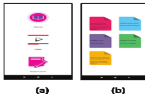
Fig 1. (a) Main menu screen; (b) Flipbook screen menu

In this learning media development research, a feasibility test was carried out on the media by involving validation and product use tests. The validation test was conducted by the Physics Education Study Program of the Teaching and Education Faculty of Muhammadiyah University and Petronas University Technology Malaysia as media experts, and the validation test of the material on the application was carried out by two Physics Education Study Programs of the Teaching and Education Faculty of Muhammadiyah University Prof. Dr. Hamka and Petronas University of Technology Malaysia. The stages of application design, first, plan application features that support the learning process with a blended learning model. Application features designed include: a book with swipe navigation (flipbook), then an explanation of audio and video learning from lecturers, and there is also an evaluation test (quiz). After planning, build the application with the Thinkable application. The following are some screenshots of the screen design application.