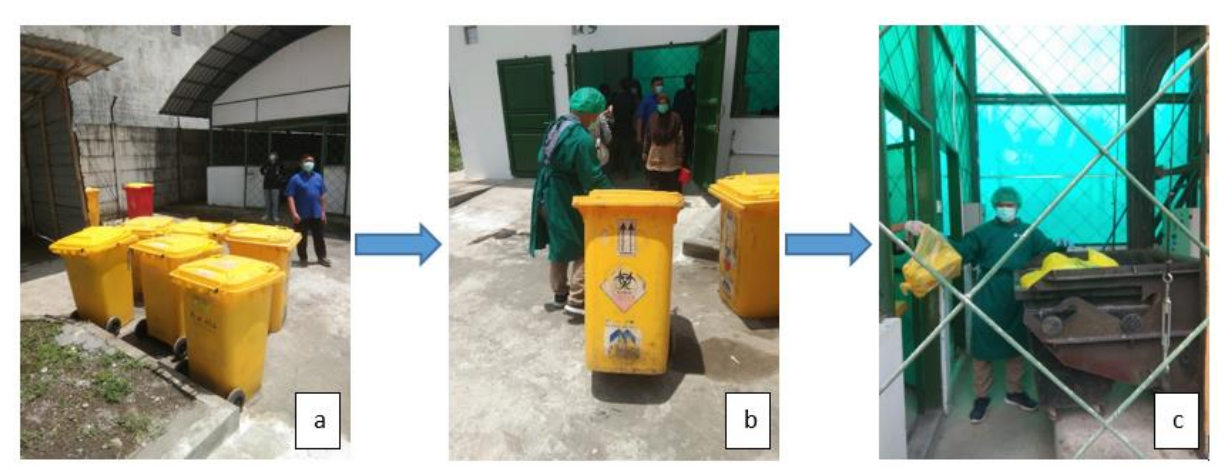
Figure 1. Flow of hazardous and toxic solid medical waste: a ) In the waste bin, obtained from the unit where there is waste generation; b ) Transportation from generating unit to temporary disposal and processing unit (incinerator); c ) Process of destroying waste by incinerator (combustion method).

An overview of the process flow of hazardous and toxic waste management can be seen in the following figure: