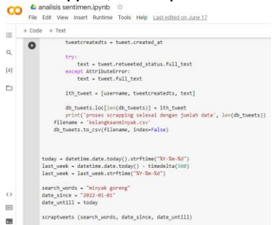
Figure 7. Python Coding to Pull Twitter Data

5. Enter the code for crawling the data. Set words, the start and end dates and the amount of data you want to pull, wait a while and the results of the data pull will appear, then export it into csv form.