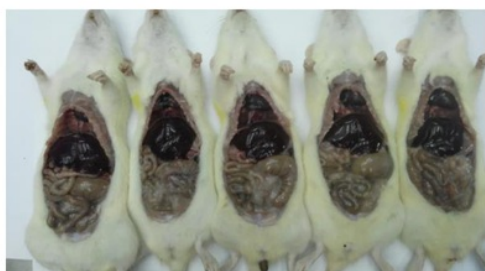
Figure 1. Macroscopic Observation of Visceral Organs of Wistar Rats

normal range. During 24 hours of observation, no straub tail elevation, piloerection, ptosis, lacrimation, catalepsy, salivation, tremor, seizures and writhing were detected. Moreover, all Wistar rats showed normal response on the pineal reflex, corneal reflex, and breathing. Other parameters such as reflex, hanging, retablism, flexion, hafner, defecation and urination did not show any change after administration of the test sample. Grooming activity slightly decreased after administration of the test preparation, but still considered normal. The following figure revealed the macroscopic observation of organs on the 14th day of testing. Based on the observation, it was concluded that no organ abnormalities were found in all of the Wistar rats.