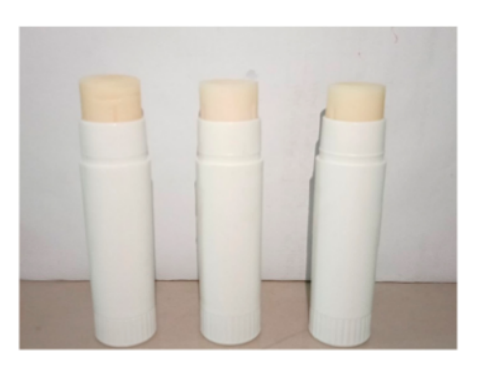
Figure 1. Nigella sativa Balm Stick.